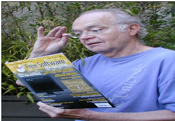
Prof. Knuth while reading one of the magazines typeset by his program TeX.

This year I had the chance and the honor of interviewing Professor Knuth. I'm proud, as a journalist and FSM's TeX-nician, to see it published in what I consider "my magazine".